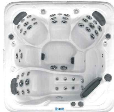
SL753 L Stereo Option Available

Size: 91" x 91" x 39" Jets: 63 Gray and Stainless Seats: 7 Adults Gallons: 450 Weight: Dry 900 lbs./Filled 4500 lbs. Approx.