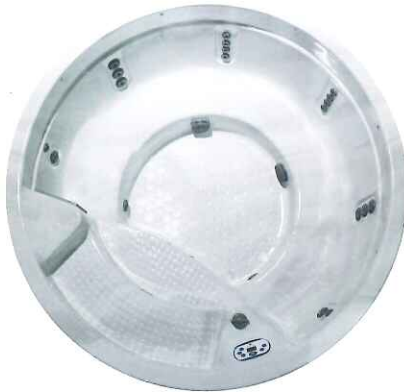
MAMMOTH | 92" X 38"