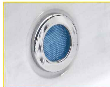
Underwater LED Lighting