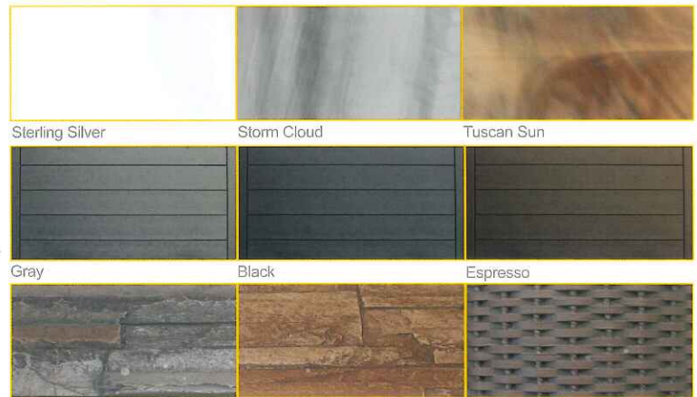
Canyon Gray Stone Sierra Brown Stone Brown Wicker

Please note: wicker and stone up-charges apply, not available on the SL525L OR SL635L