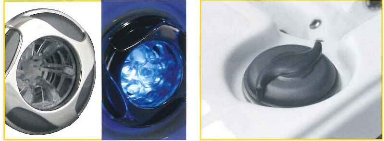
Stainless Steel Jets