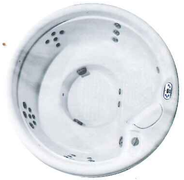
PILOT | 78.5" X 36.5"