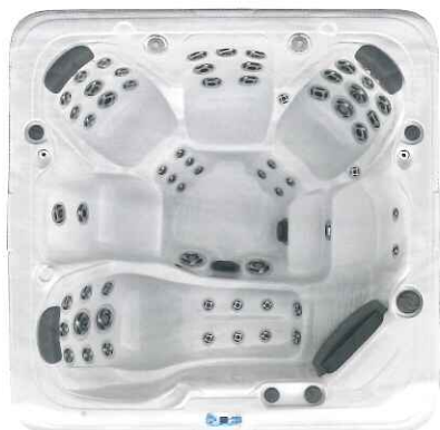
SL863 L Stereo Option Available

Size: 91" x 91" x 39" Jets: 63 Gray and Stainless Seats: 6 Adults Gallons: 450 Weight: Dry 900 lbs./Filled 4500 lbs. Approx.