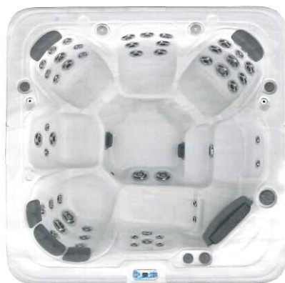
SL753 B Stereo Option Available

Size: 82" x 82" x 39" Jets: 53 Gray and Stainless Seats: 6 Adults Gallons: 350 Weight: Dry 800 lbs. /Filled 3600 lbs. Approx.