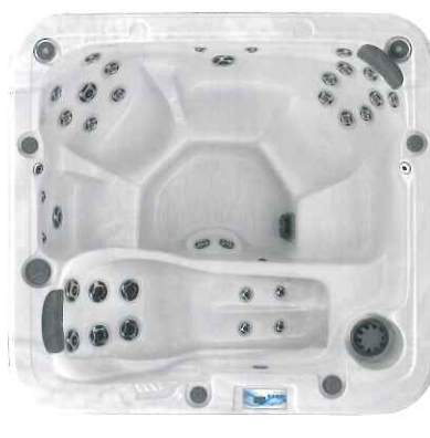
SL635 L Stereo Option Available

Size: 82" x 82" x 39" Jets: 53 Gray and Stainless Seats: 7 Adults Gallons: 350 Weight: Dry 800 lbs./Filled 3600 lbs. Approx.