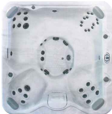
K2 | 84" X 84" X 38"