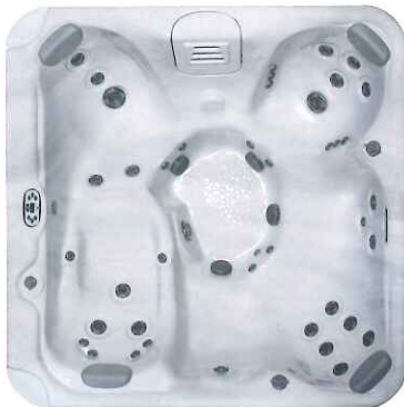
DENALI | 84" X 84" X 38"