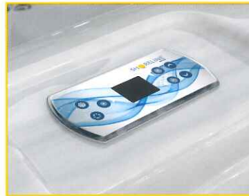
User Friendly Digital Controls*