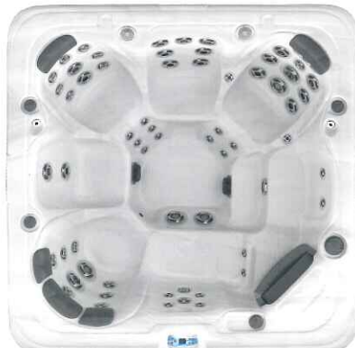
SL863 B Stereo Option Available

Size: 91" x 91" x 39" Jets: 63 Gray and Stainless Seats: 6 Adults Gallons: 450 Weight: Dry 900 lbs./Filled 4500 lbs. Approx.