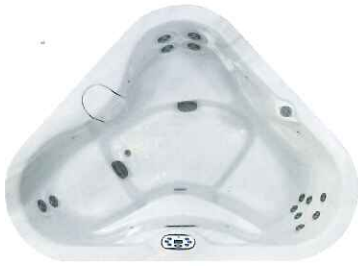
TETON | 59" X 82" X 29"