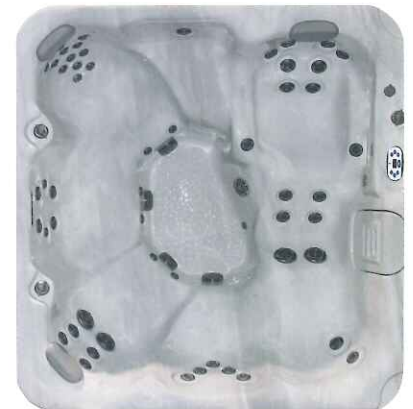
EVEREST | 89" X 93" X 40"